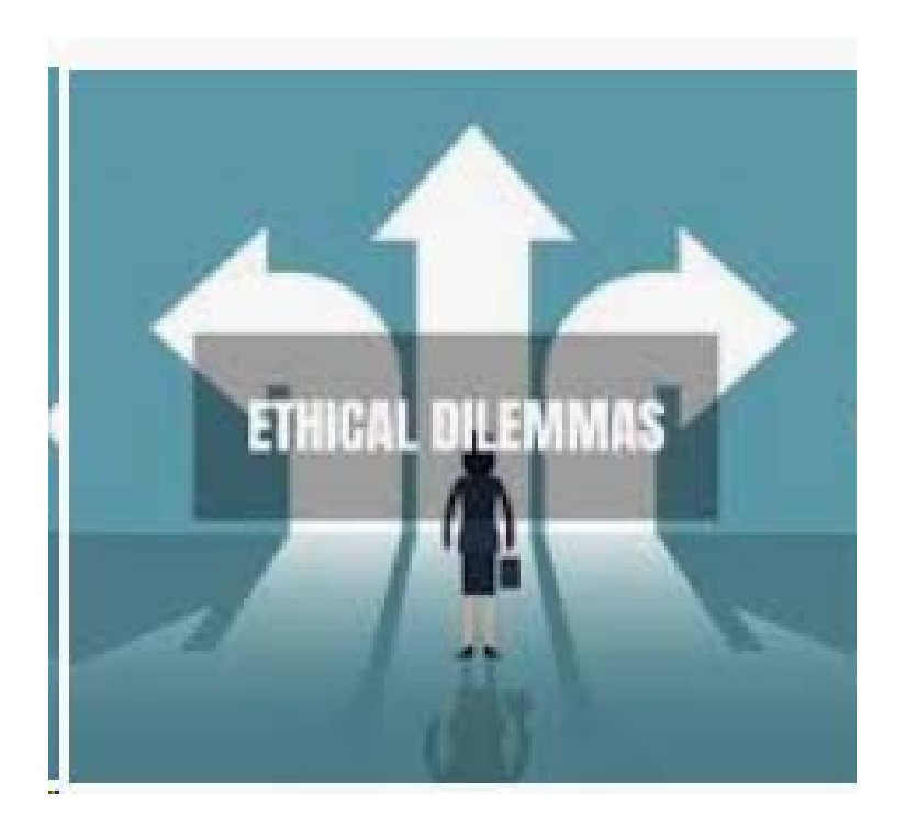
7 Steps for resolving ethical dilemma